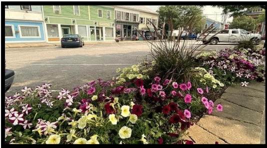
Nunda Garden Club Flowers in the Village Mall

A: "The Village is working on or has completed a number of projects. We also work with other organizations and municipalities on mutually beneficial projects. Some of these projects are described below: